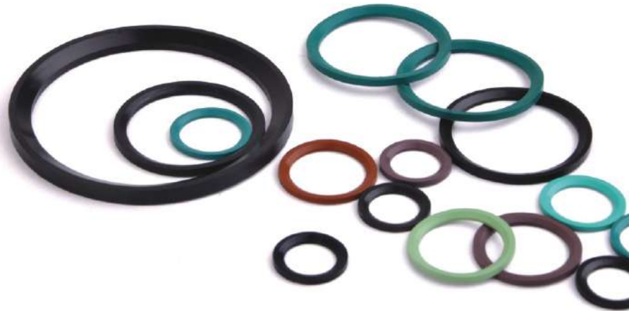
NBR 90 FKM 85